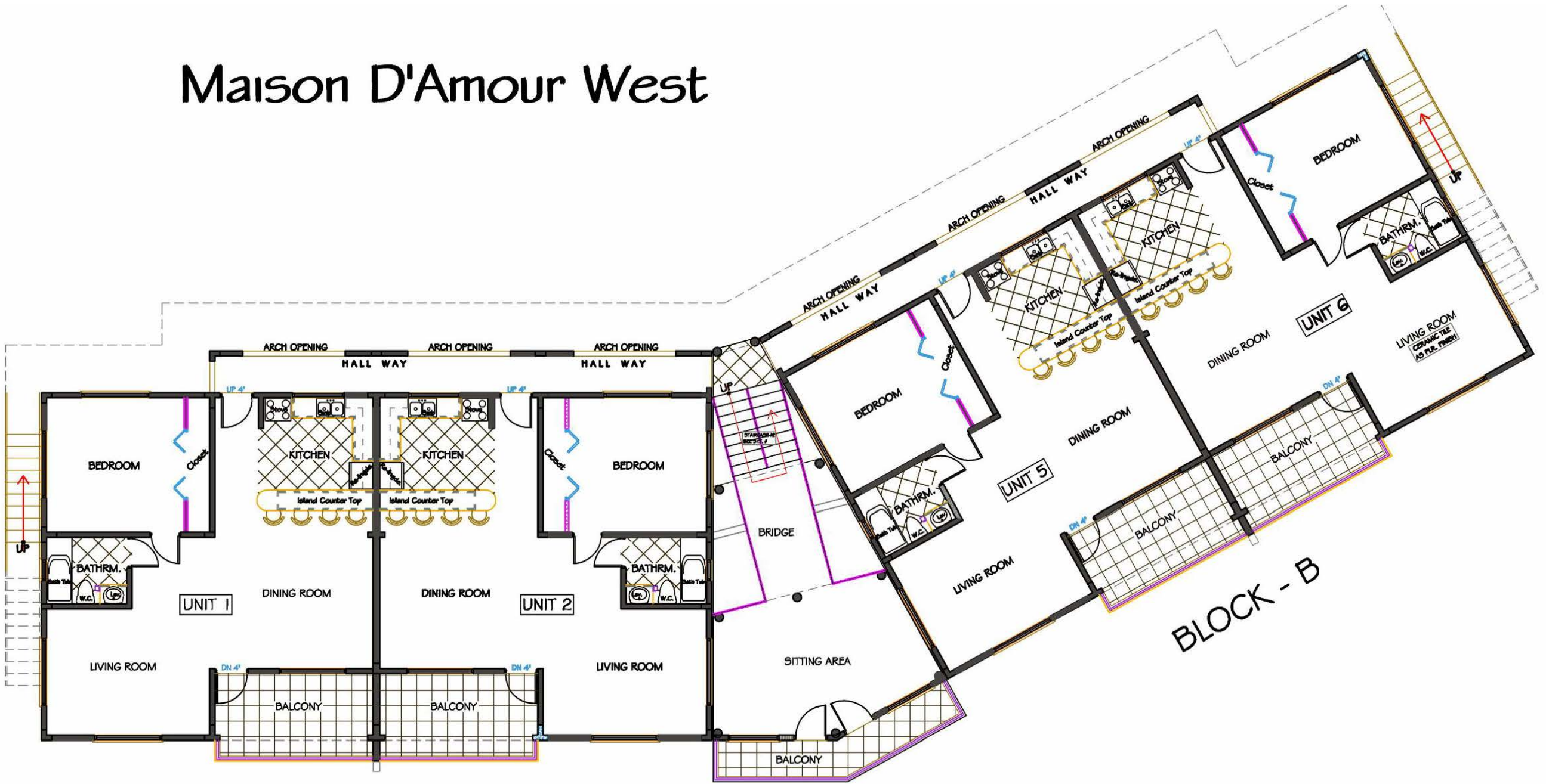
BLOCK A & B - FIRST FLOOR PLAN