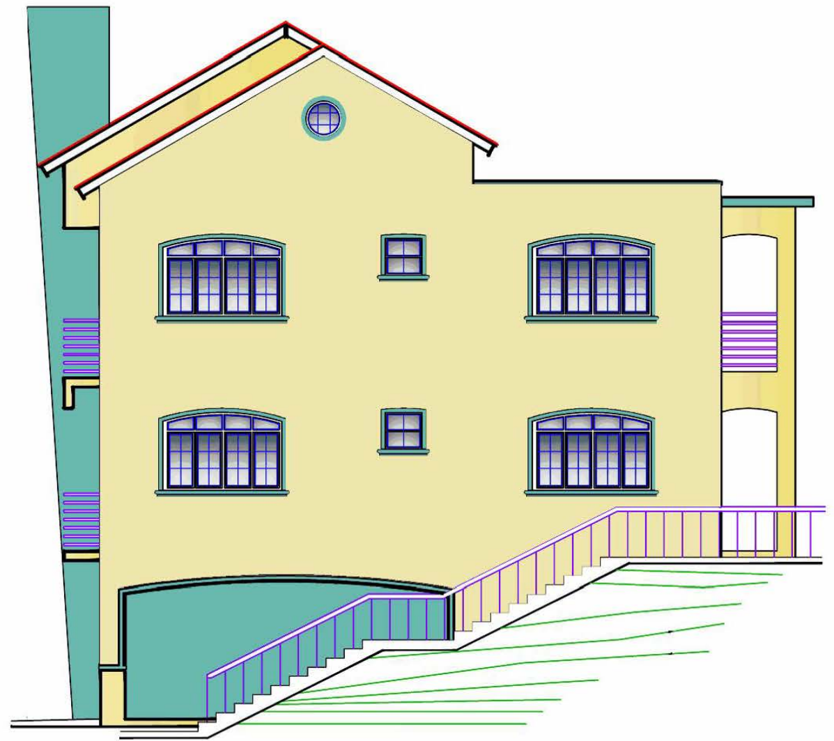
TYP. RIGHTSIDE ELEVATION - #2