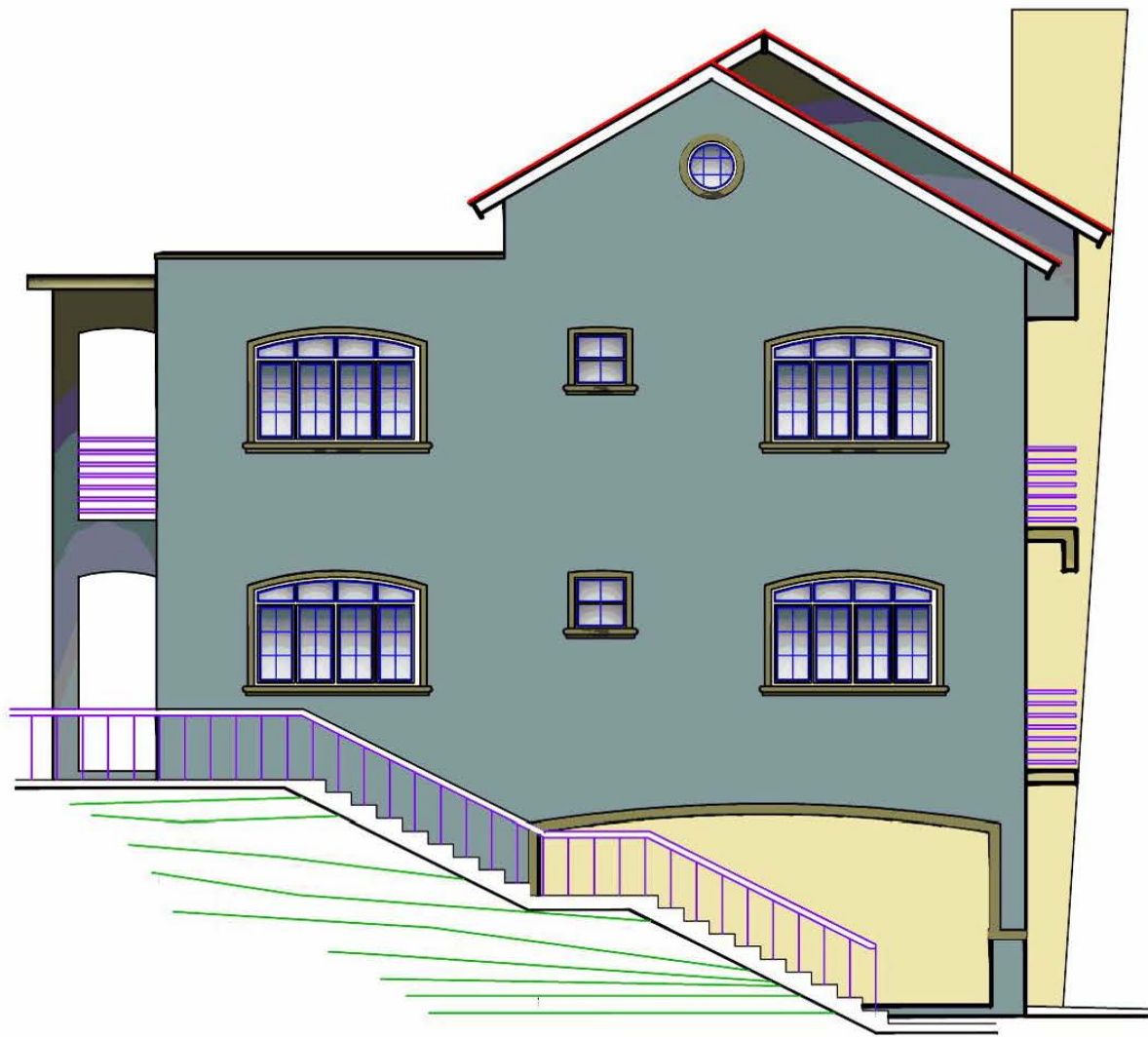
TYP. LEFTSIDE ELEVATION - #4