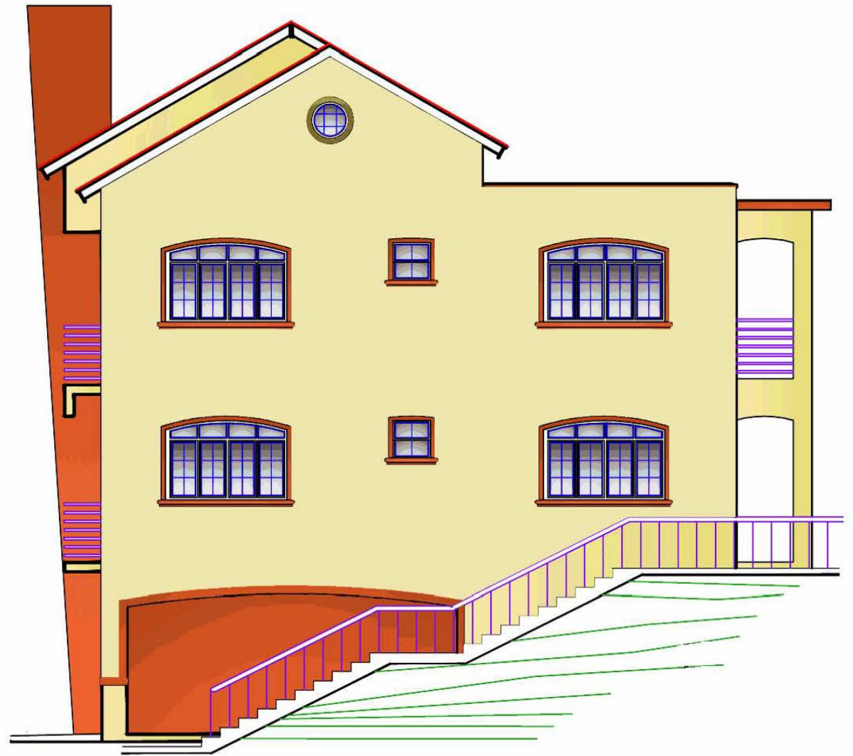
TYP. RIGHTSIDE ELEVATION - #2