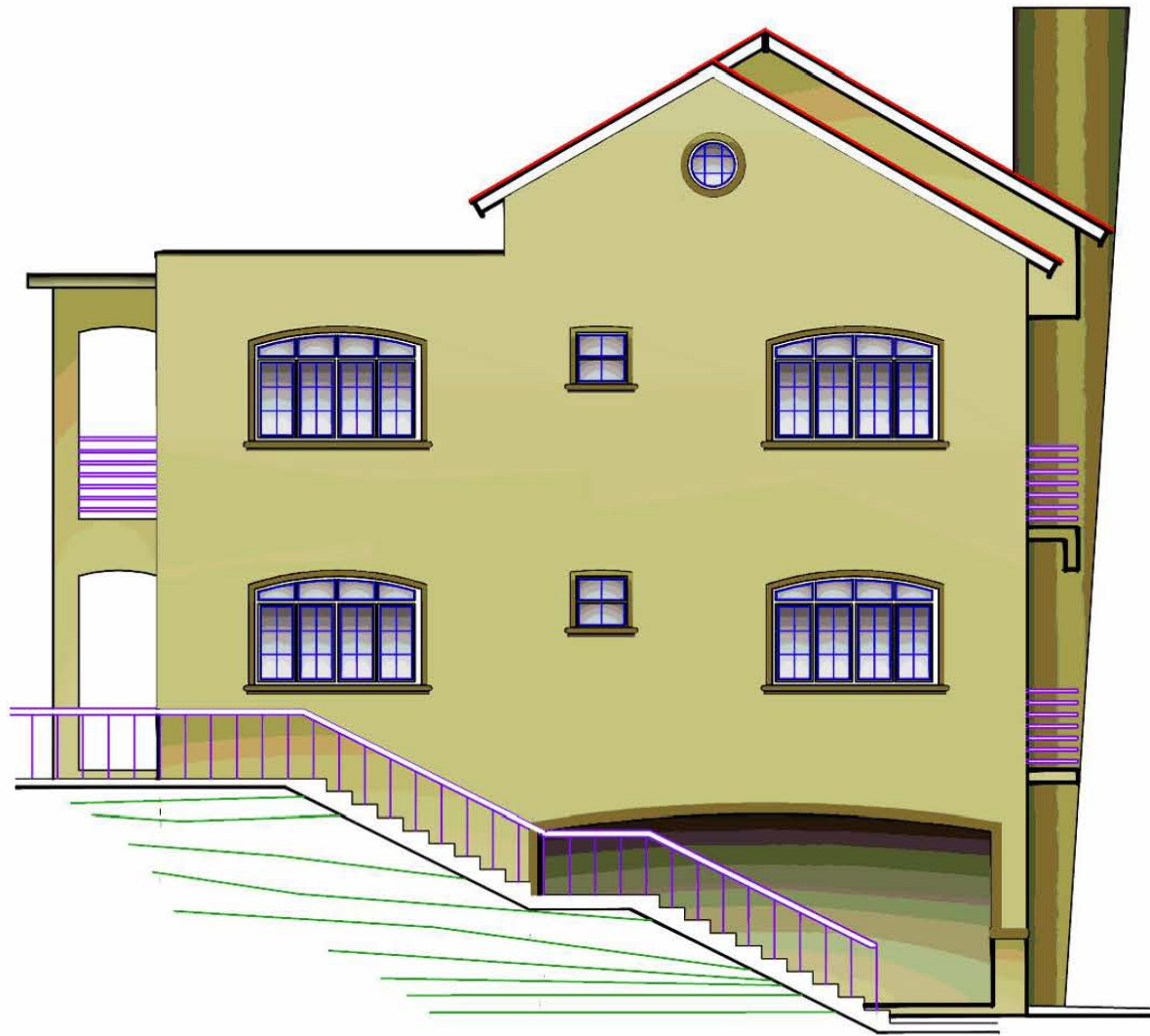
TYP. LEFTSIDE ELEVATION - #4